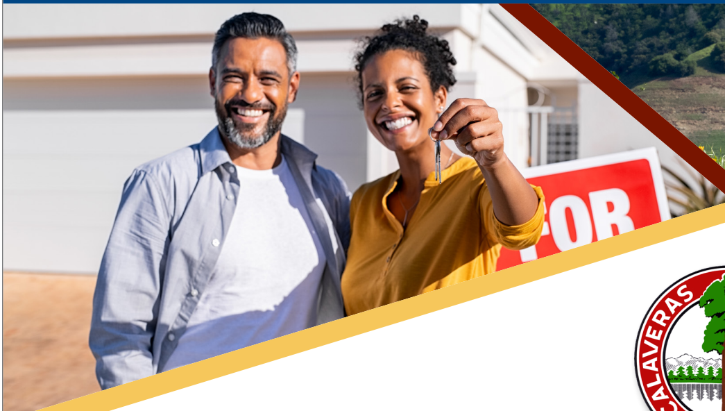
Calaveras County, CA